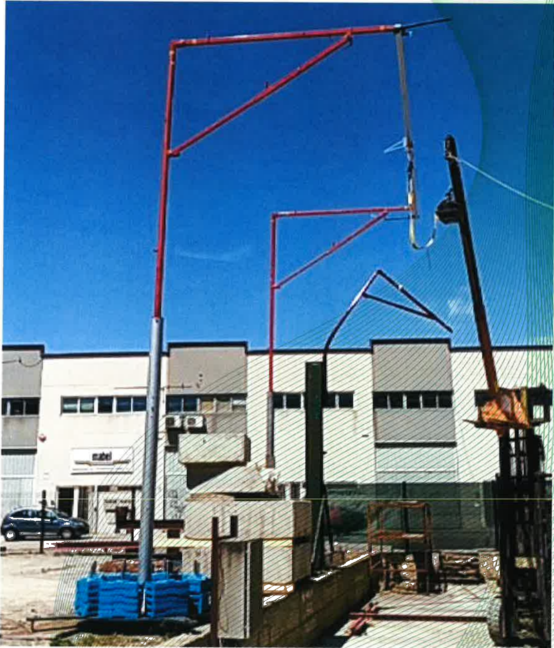
Fig. 4: Anchor device type D (type Horizontal SafeAccess and NAV2 trolley made by FALLPROTEC SA) with anchors of type AlsiPercha and mobile base units