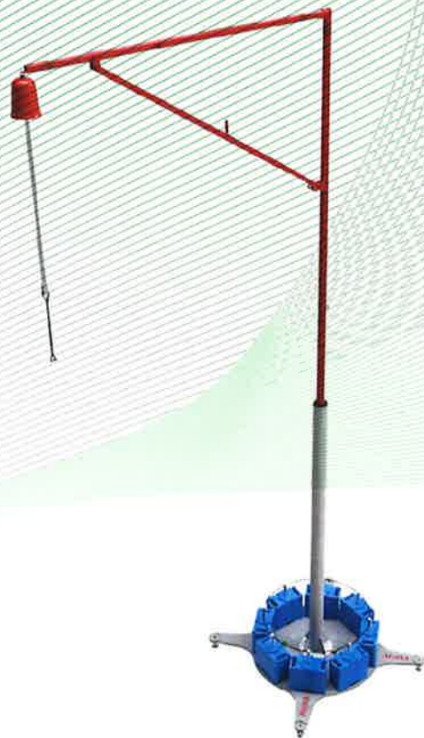
Fig. 3: Anchor, type: mobile base unit