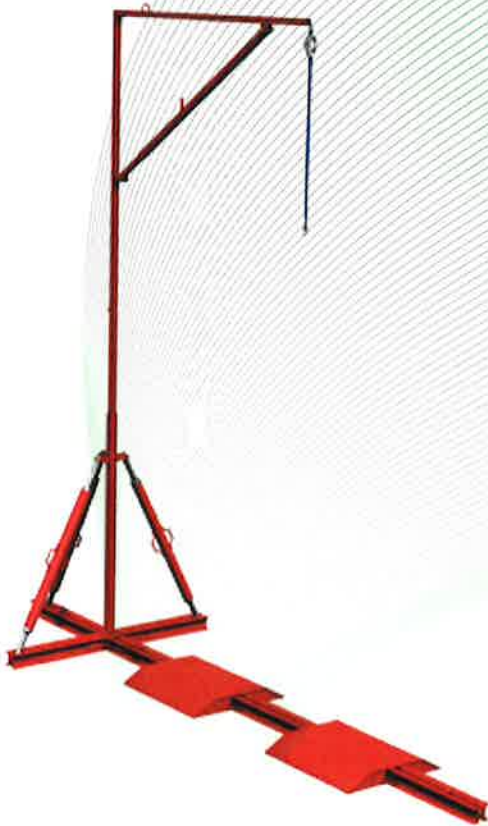
Fig. 2: Anchor, type: counterweight MF