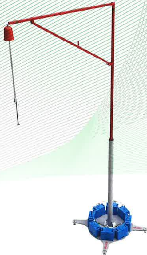
Fig. 3: Anchor, type: mobile base unit