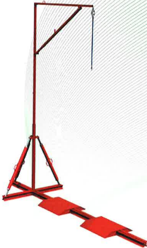
Fig. 2: Anchor, type: counterweight MF