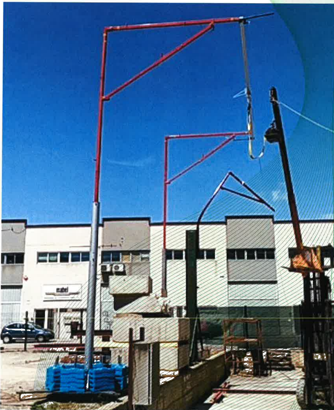
Fig. 4: Anchor device type D (type Horizontal SafeAccess and NAV2 trolley made by FALLPROTEC SA) with anchors of type AluPercha and mobile base units